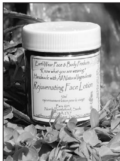
Left: Bessant's rejuvenating face lotion Right: Bessant's lavender almond hand & body lotion